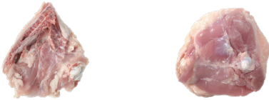
2 Anatomical thighs